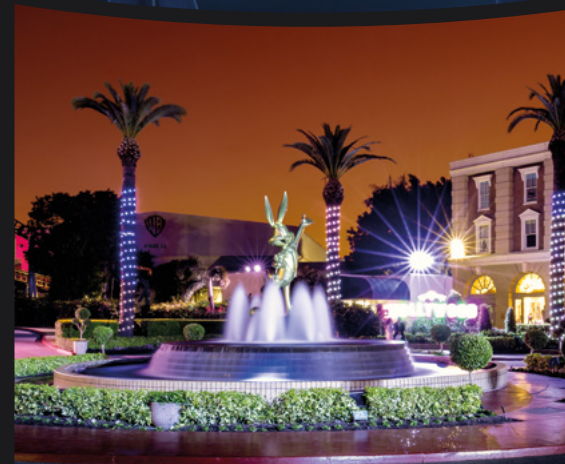
Fountain of Fame