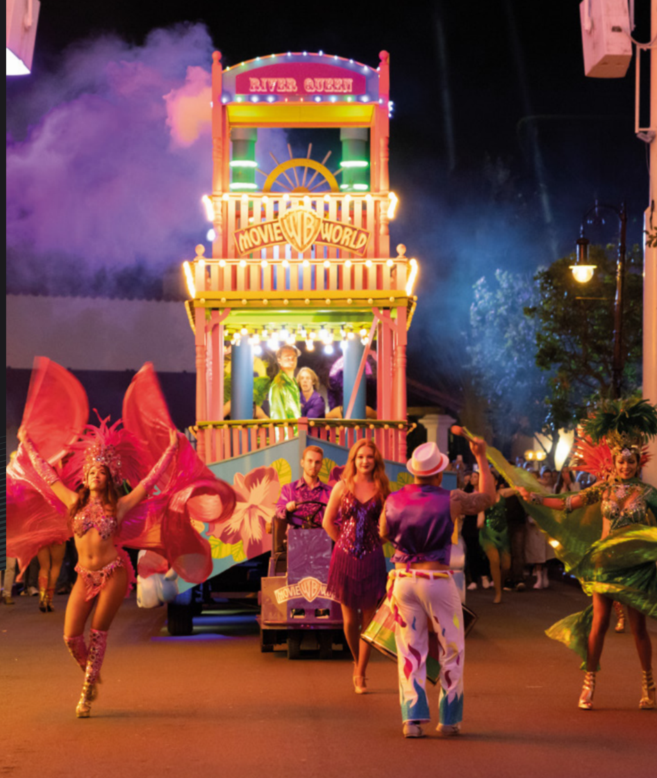
Main Street Parade

Let our expert team curate your blockbuster event to suit your chosen theme and budget. Whether it's an intimate dinner or a cast of thousands, we offer a diverse range of evening event options. Picture a formal dinner in Justice League Hall, Wild West barbecues, star-studded cocktail soirées, or even an international street party extravaganza. The possibilities for unforgettable evening gatherings at this exceptional venue are boundless, making it an unparalleled choice.