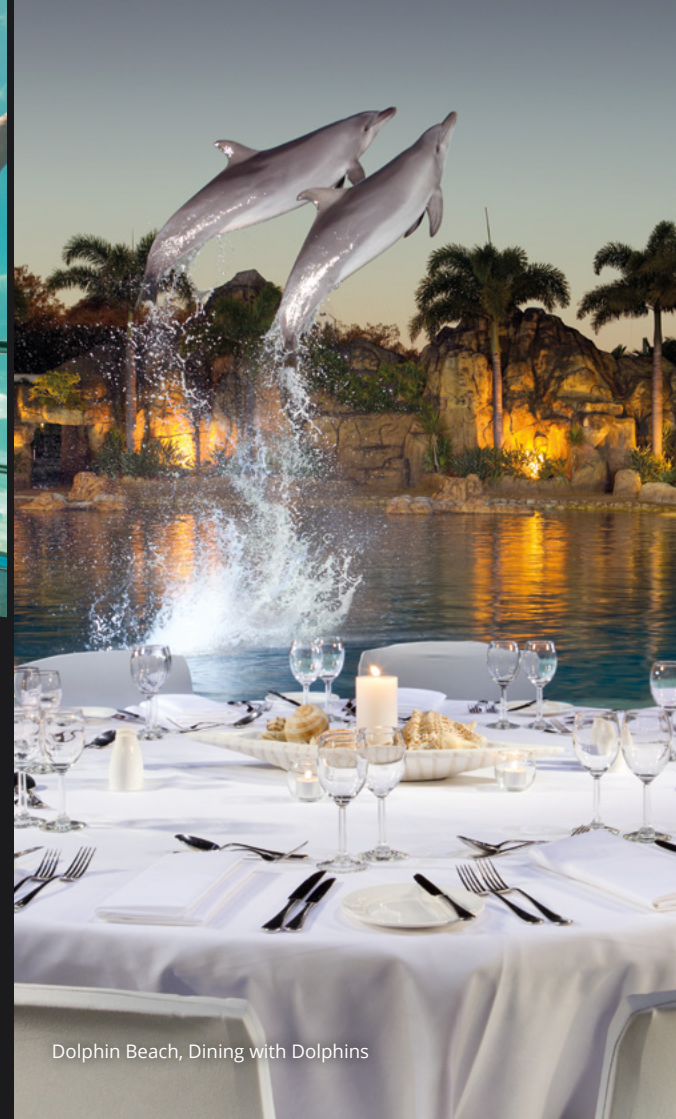
Dolphin Beach, Dining with Dolphins