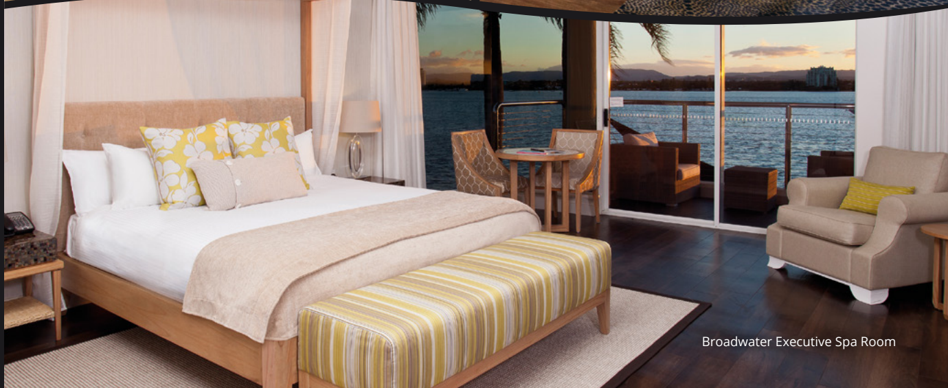
Broadwater Executive Spa Room