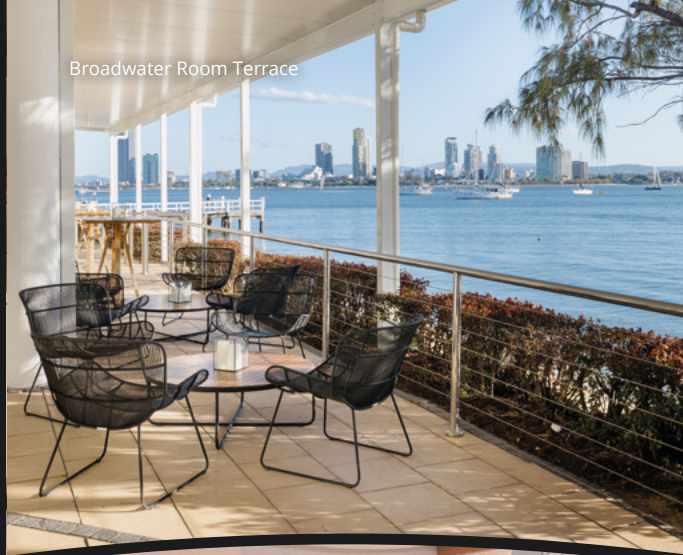
Broadwater Room Terrace